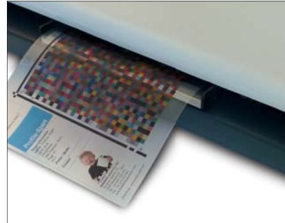
For transparent media to apply color management where images are illuminated from behind (Spectro Swing T and Spectro Swing RT)