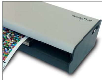
Easy to use thanks to its "no-button operation"

Available in transmission, reflection or combined version!