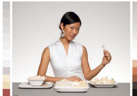
Standard ICC Profile