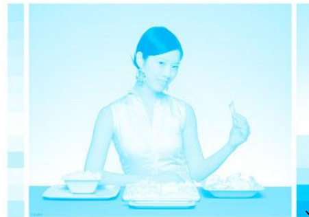
ICC Profile with ink-saving